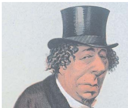
Disraeli depicted in Vanity Fair, 1874 (detail)

The arrangement of the book into four parts, subdivided into chapters with sub-headings, means that the text can be used by those studying a particular theme or time period. Each section is a compre-