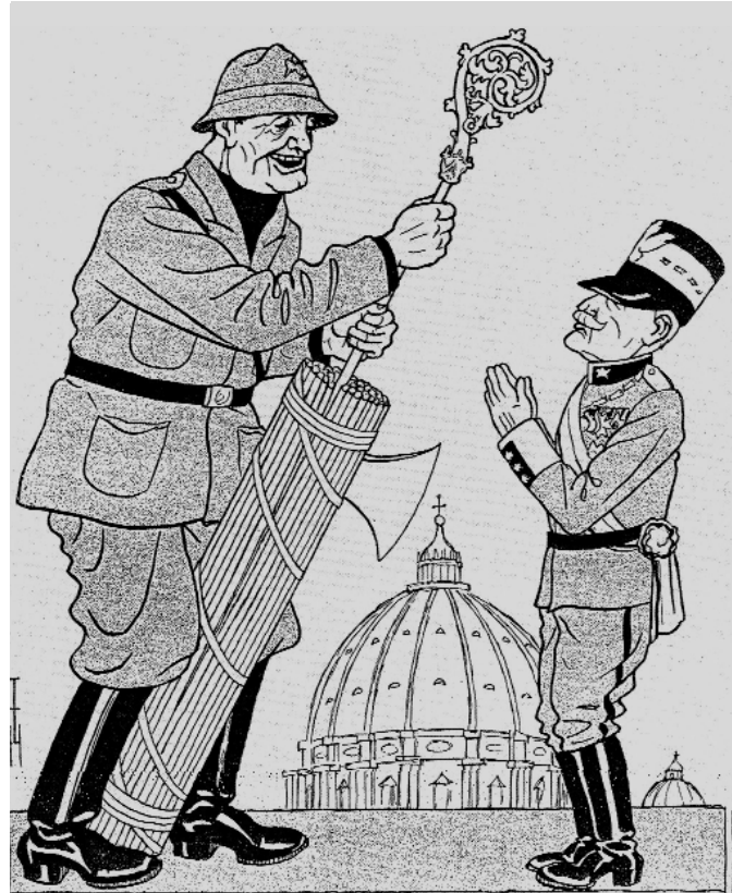
This cartoon from Germany, after the 1929 Lateran Treaty with the papacy depicts the King, Victor Emmanuel III, begging Mussolini for some restoration of authority such as that accorded to the Pope

Perhaps the most surprising thing about the speed of Fascism's rise to power is the fact that it was an almost entirely new political ideology and movement . In fairness, so was German National Socialism. Whereas movements such as liberal democracy, socialism and communism all existed in some form in the nineteenth century, fascism