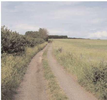
The track to the remote Leatherslade Farm that had been rented. The booty was taken to the farm and divided. Fearing discovery, they left hurriedly

Bruce Reynolds, a London antique dealer and burglar, is associated with the formation of