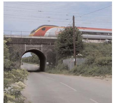
A Virgin train speeds by the embankment, this year, at Bridego Bridge where the mailbags were thrown down to waiting vehicles (see HERE on map)