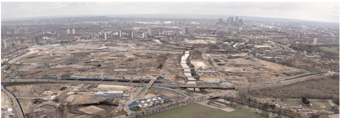
The 250-acre Olympic Park project, as seen around 2008, looking south towards the O2 arena (Millennium Dome) just right of centre with the Canary Wharf towers further to the west (to the right of the O2), both in the middle distance. The legacy, with athletes' village, stadia, media centre ... will be very considerable

about the 2012 games is their connection with the regeneration of 250 largely derelict acres in East London. Work on the Olympic Park construction site, one of the largest in Europe, costing some £9 billion over five years, is well advanced. After the games the Olympic Park will be transformed into one of the largest urban parks created over the last 150 years. It will follow the River Lea and stretch from Hertfordshire to the tidal Thames. In addition, the use of the athletes' village, which will become housing, the stadia, media centre, car parks and improved transport, will transform this area of East London.